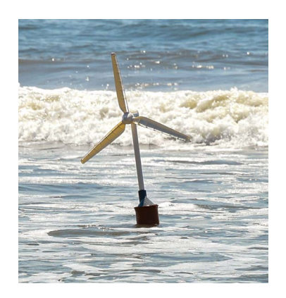
Kids built and launched first Floating offshore wind turbines in U.S. waters!

Atlantic Shores looks forward to continuing its partnership with OffshoreWind4Kids and to bringing more hands-on science experiences to their Atlantic City ECO Center.