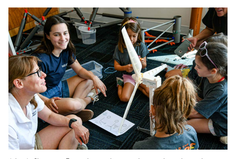
Atlantic Shores staff members volunteered to teach students about offshore wind- and had a lot of fun in the process!